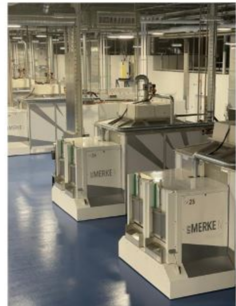
Norsk's fleet of Merke AM equipment

Norsk's AM will focus on the long-standing, workhorse alloy Ti-6Al-4V wire, but new, advanced titanium and other metal alloys also are under consideration. Mayer said their titanium wire additive process is used for large, primary structure parts that require high material deposition rates, with powder metal AM being best suited for smaller, more detailed components. "Our market