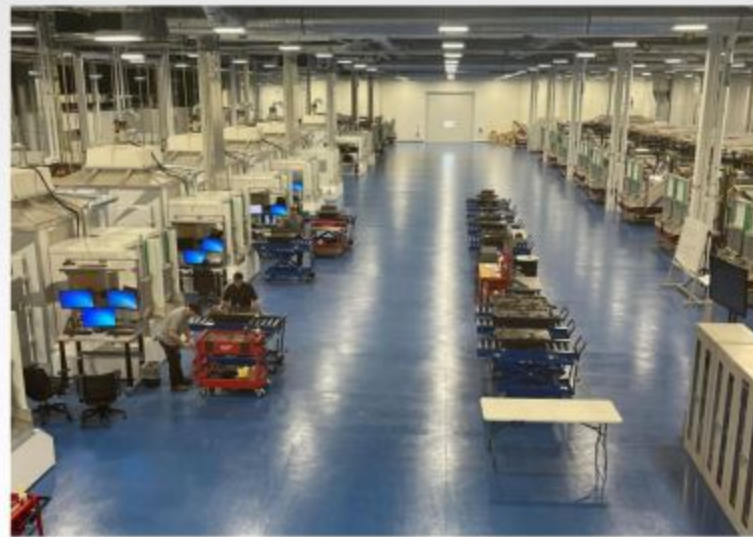
Norsk's Plattsburgh, NY, factory floor

The company's annual report indicated that Norsk's "successful