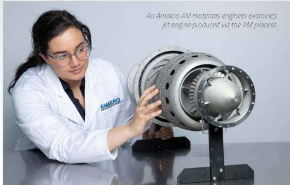
An Amaero AM materials engineer examines jet engine produced via the AM process

Earlier this year, TITANIUM TODAY reported on Amaero International Limited (website: https://www.amaero.com.au ), an Australian-based public company specializing in the provision of end-to-end metal additive manufacturing solutions in terms of materials, services, equipment and